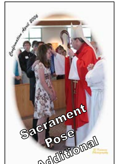
Sacrament Pose Additional